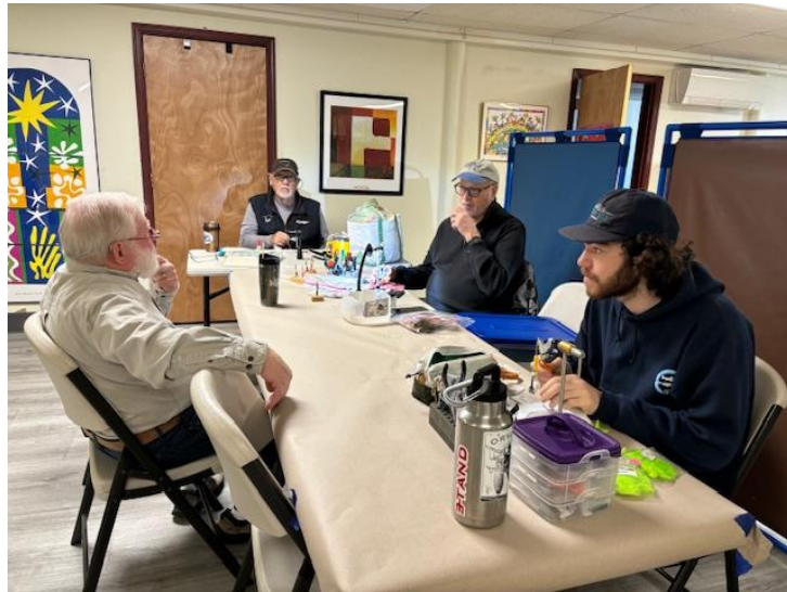
Fly tying at Lewes Presbyterian Church basement winter 2024 on Sat. mornings.